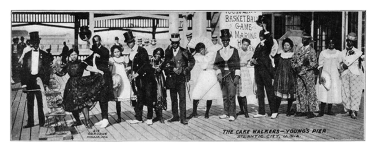
Entertainment like the renowned Cake Walkers delighted the public.

To attract more crowds, the two installed an aquarium, ballrooms, and booked regular band concerts. Vaudeville show performances were given in the pier's theatre.