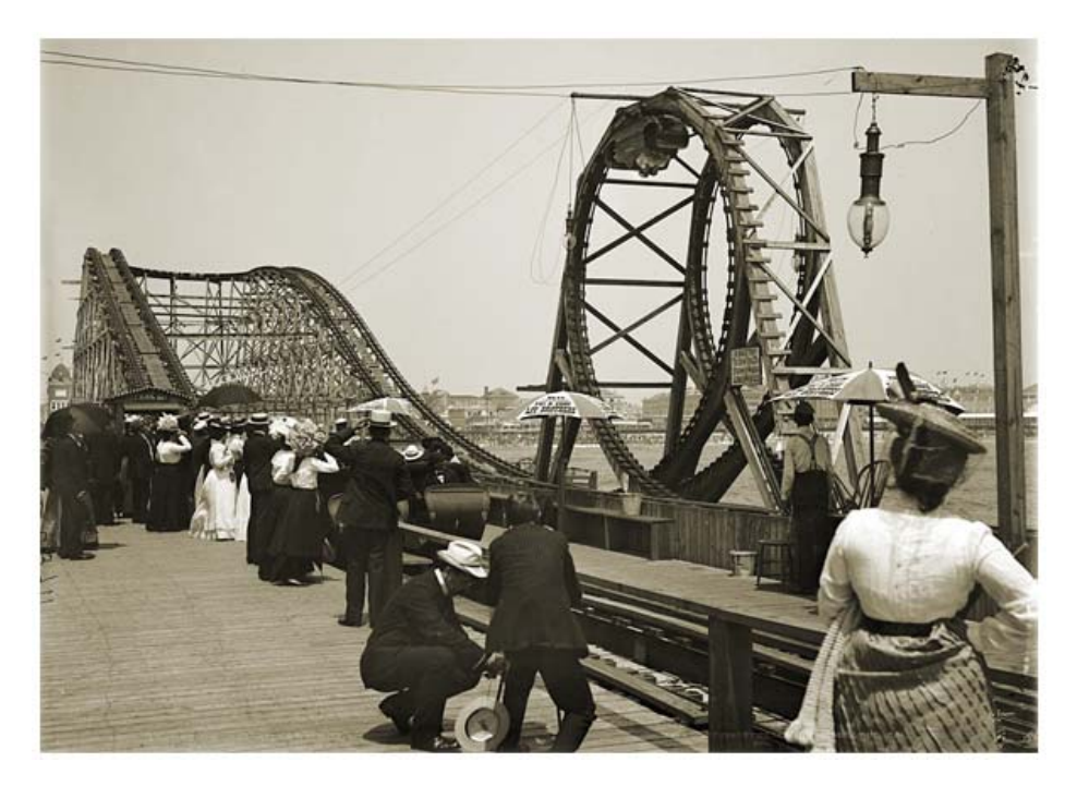
Flip-Flap Railroad AKA Looping-the-Loop, c.1902