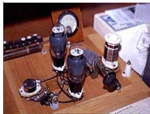
A vintage breadboard-style transmitter.